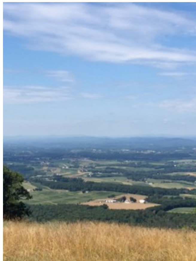
Hey, moreMuckleratz pictures! "This is the view our ride is known for. This is the hang glider launch in Weiser State Forest."